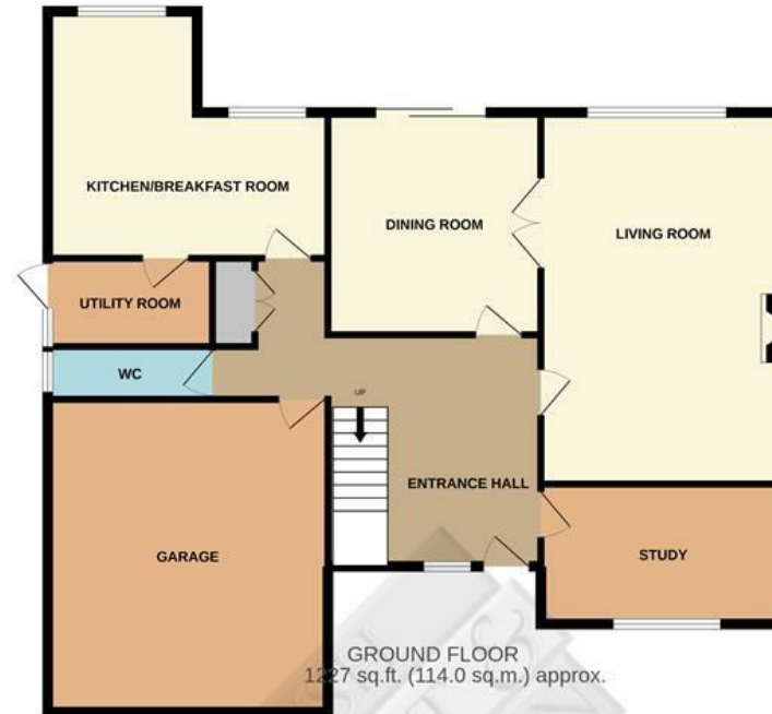
GROUND FLOOR 1227 sq.ft. (114.0 sq.m.) approx.