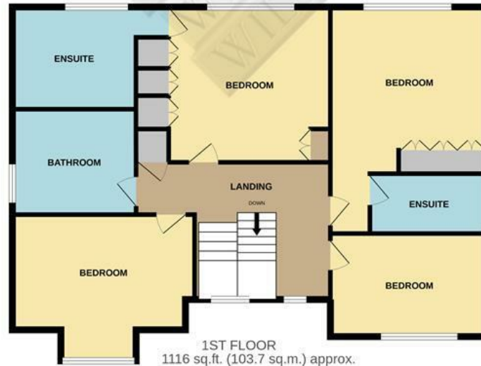
1ST FLOOR 1116 sq.ft. (103.7 sq.m.) approx.

TOTAL FLOOR AREA : 2342 sq.ft. (217.6 sq.m.) approx.